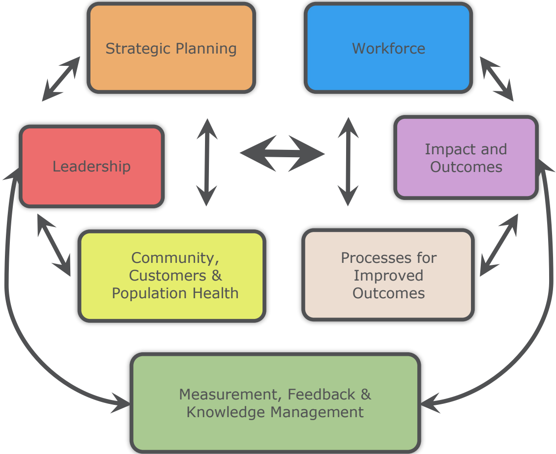
Figure 1: Components of the Performance Excellence (PE) Blueprint